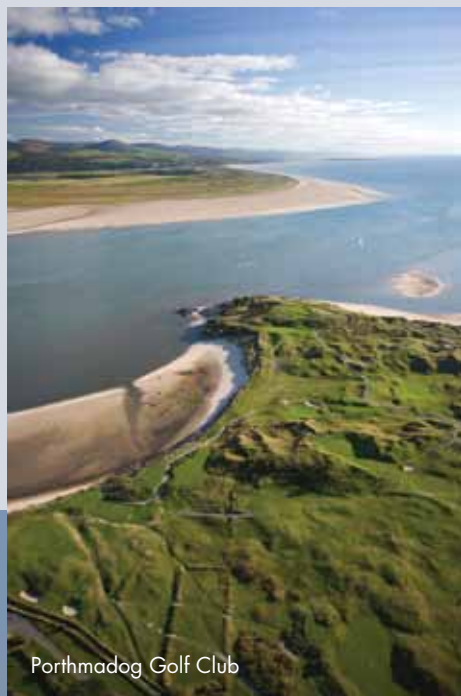
Porthmadog Golf Club

Royal Porthcawl Golf Club ( www.royalportcawl.com ) may not be as recognized as many other seaside tracks in the British Isles, but their stock will rise as the international golf media taste the buffet of Welsh links. Located just west of Cardiff Royal, Porthcawl was established in 1891. It is difficult to imagine a finer, more demanding