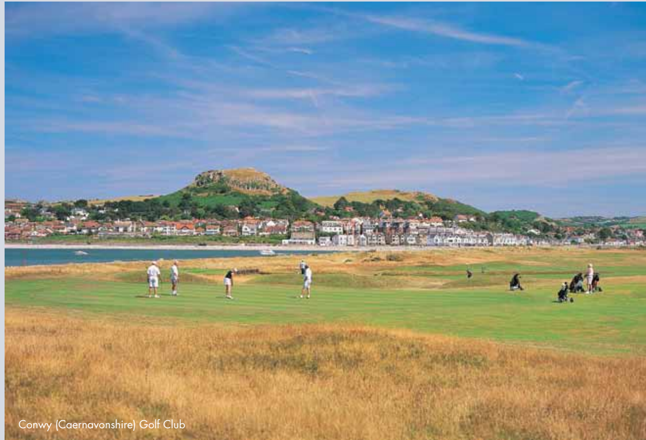
Conwy (Caernavonshire) Golf Club

( www.nefyn-golf-club.co.uk ) still sparks my heart with her unique atmosphere and is an overwhelming dose of Welsh culture and links golf. Nefyn's site is simply breathtaking, with the links set on a cliff top peninsula that could easily be called the eastern sister to Pebble Beach. However, the experience is far from the high-end resort ambiance that permeates Pebble Beach. The first hole runs along a one-lane