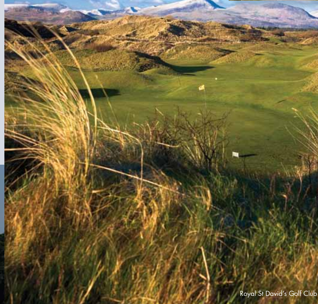
Royal St David's Golf Club

links course. Moreover, the club hosted the Welsh Amateur Championship in 2008, and had the 2010 Ryder Cup been awarded to Royal Porthcawl, our boys would have had their hands full on a course with bunkering as severe as the gale force winds that would negate the game they play on the PGA Tour. In addition to providing the gusts that reinforce the phrase, "Nae wind, Nae golf," the Glamorgan coast is also an attraction for surfing. Watching the long boarders provides just a taste of the waves of excitement waiting on one of Wales' finest tests of golfing skill.