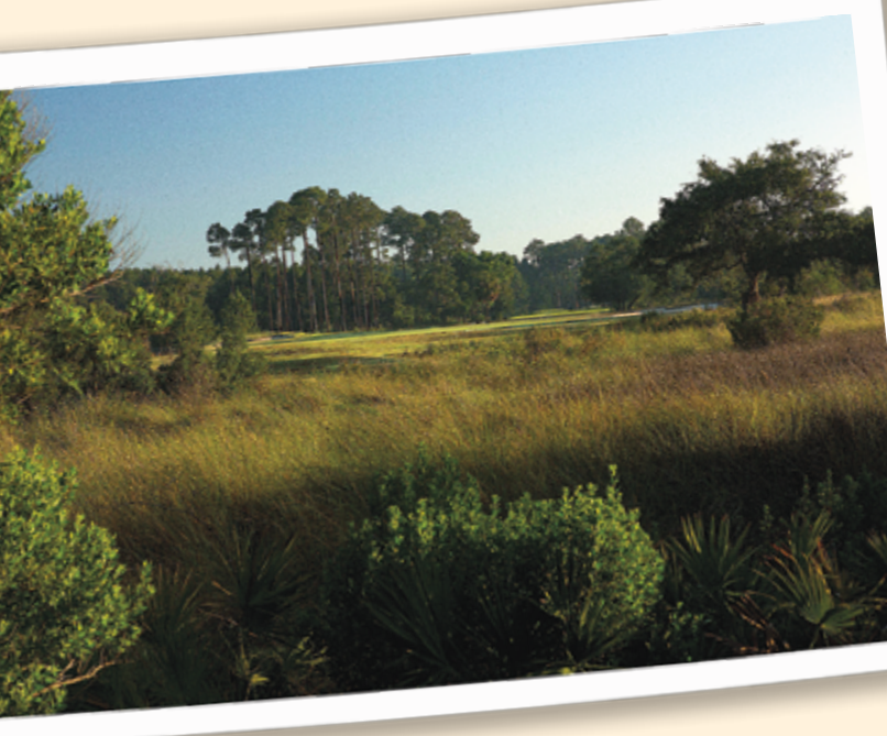
table options that will satisfy your appetite. Cabin Bluff has been around a long time. It was President Calvin Coolidge's favorite hunting grounds back in the 1930s. So don't just chew the fat. Take a trip down south and experience a Charleston Chew and a whole lot more.

This all-inclusive 24.000 acre retreat also serves farm-to-