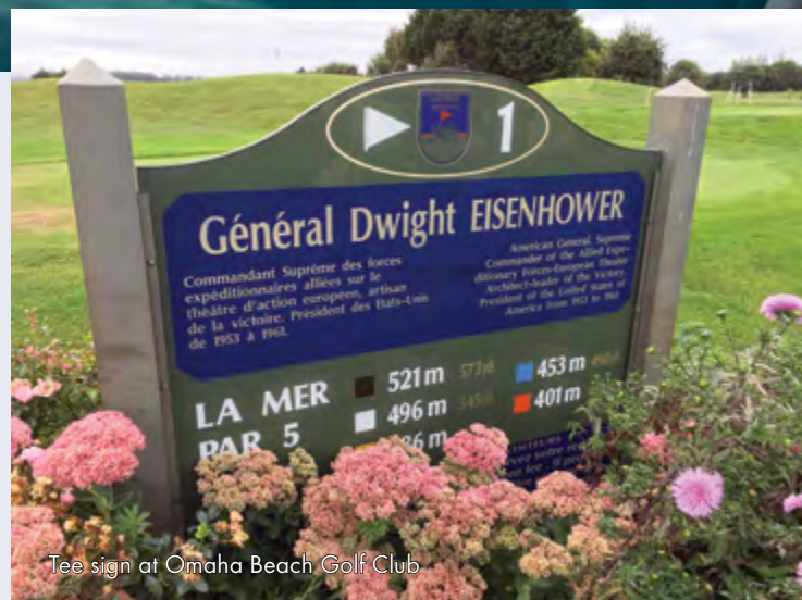
Tee sign at Omaha Beach Golf Club

yards long and features fairways with significant drops and greens that will test your stroke. This course was a joy to play and not as testy as Le Chateau. The par-4 ninth hole stands out, playing uphill with a waterfall and a pond along the right side. The par-5 18th starts with a tee set high on a plateau playing down to brilliant water features along the entire right side, making it an ideal and scenic risk-reward finishing hole.