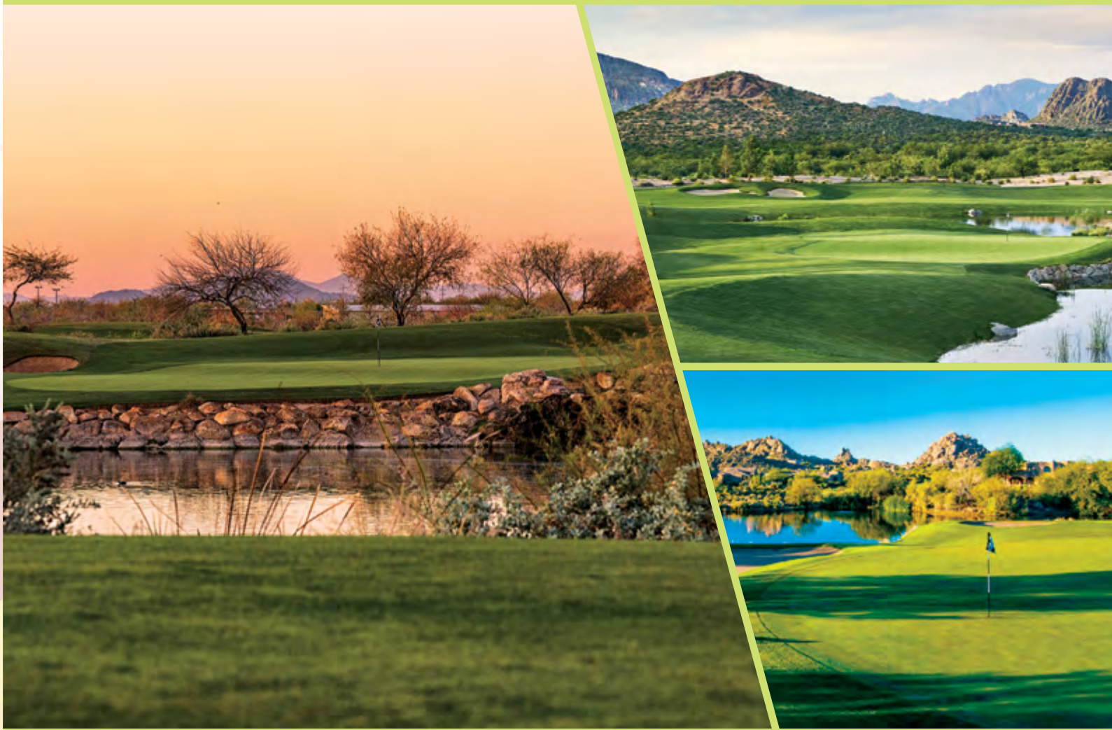
Left to right: Whirlwind Golf Club at Wild Horse Pass, Chandler; Sewailo Golf Club, Tucson; Troon North Golf Club, Scottsdale.

EXPERIENCE ARIZONA’S BEST COURSES AT THE BEST AVAILABLE RATES: TroonGolfAZ.com