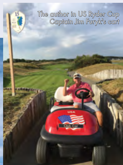
The author in US Ryder Cup Captain Jim Furyk's cart