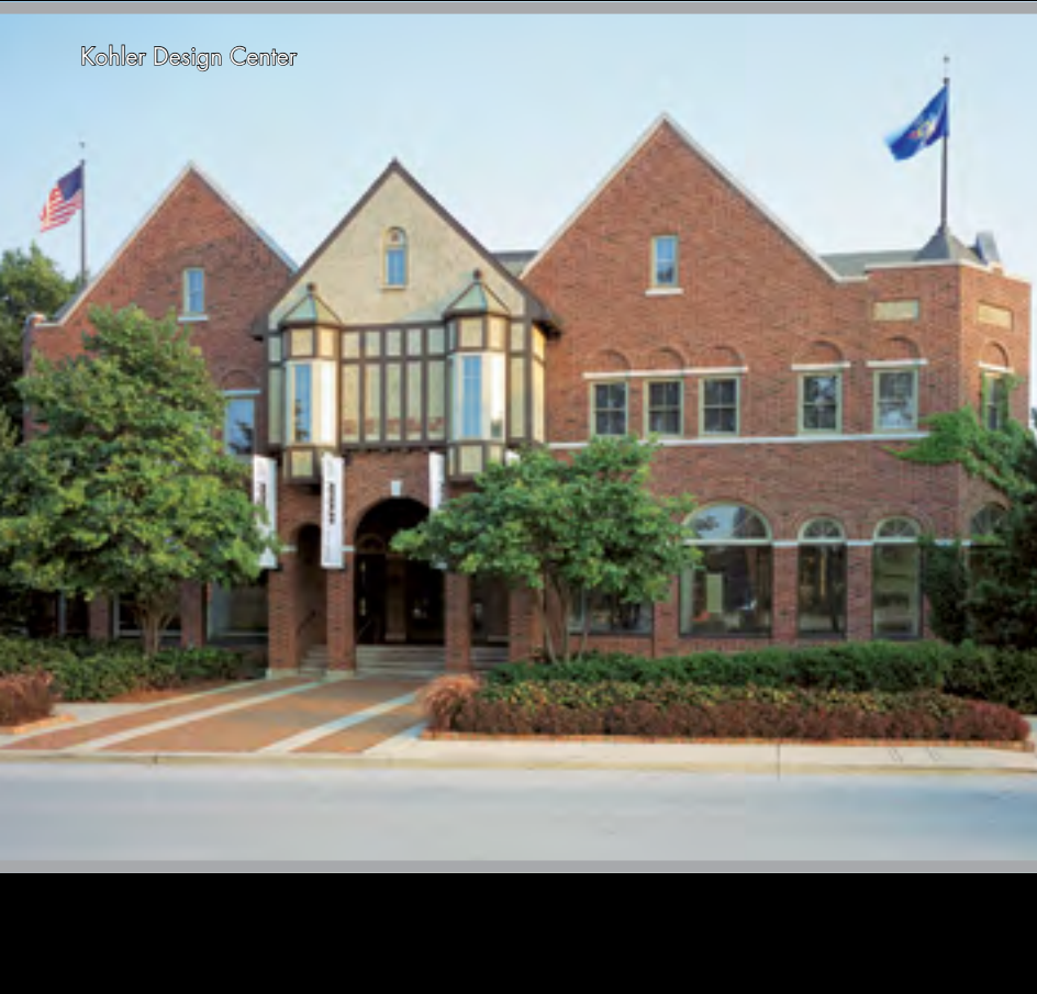
Kohler Design Center

Our memories of the 2010 PGA Championship are probably about a gambler taking a risk on the third playoff hole, and a club grounding that cost a young gun his first major. The answer to the inevitable trivia question will be ‘a man named Bubba’ and ‘a kid named Dustin,’ but the eventual champion in 2010 was Martin Kaymer. Kaymer played brilliantly and hoisted the Wanamaker trophy for his first major championship.