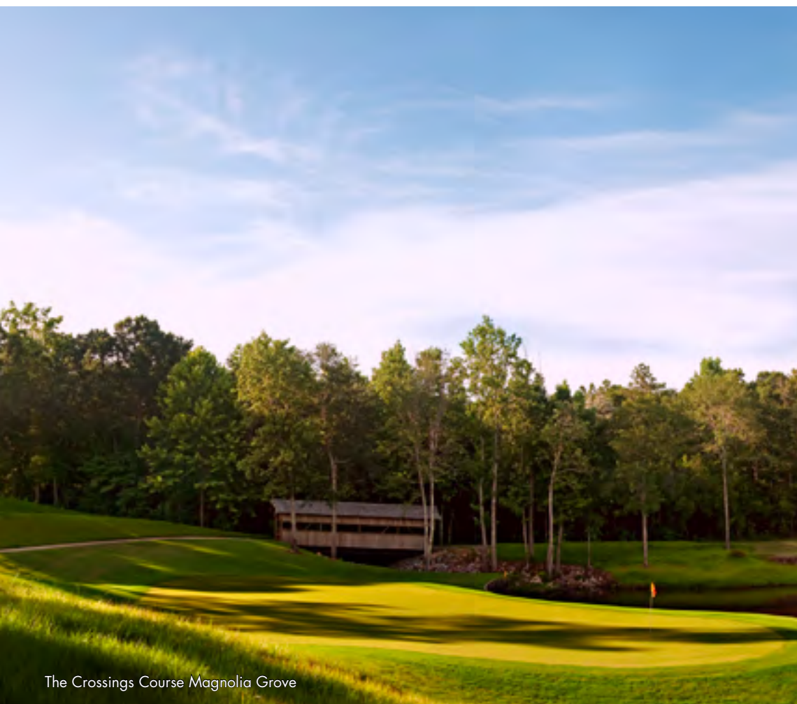
The Crossings Course Magnolia Grove

A new PGA TOUR tournament sponsored by Barbasol, the No. 1 shaving cream brand in the U.S., will debut in 2015 at the Robert Trent Jones Golf Trail at Grand National. A four-year agreement establishing the Barbasol Championship was announced by