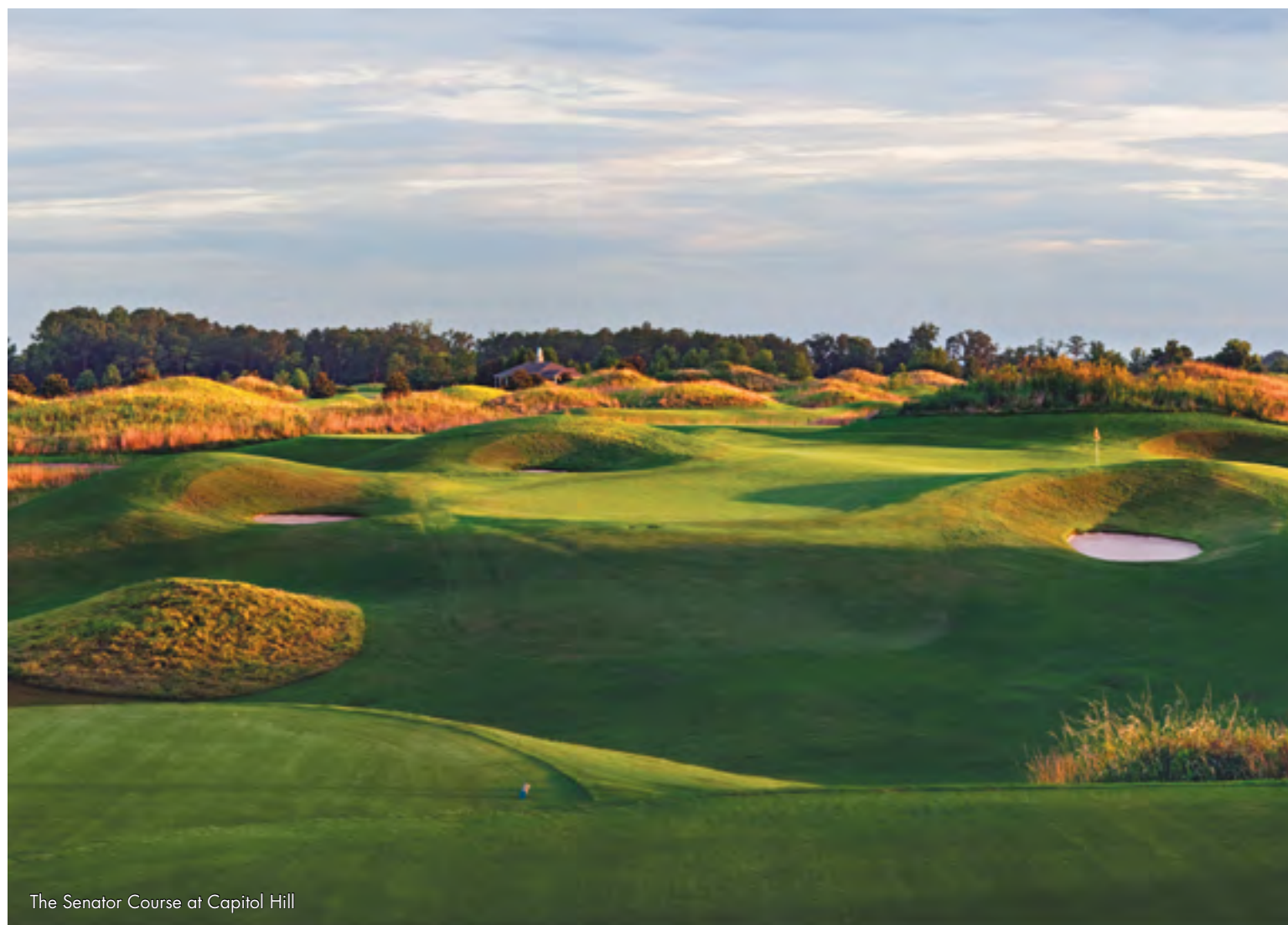
The Senator Course at Capitol Hill