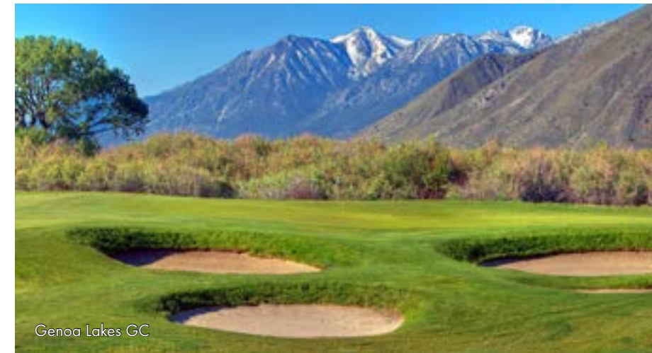
Genoa Lakes GC